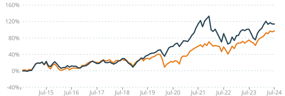
■ Heptagon European Focus Equity Fund ■ MSCI Europe NR EUR