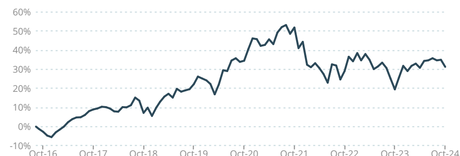
■ Heptagon Future Trends Hedged Fund