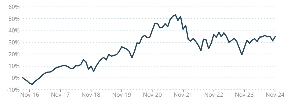
■ Heptagon Future Trends Hedged Fund