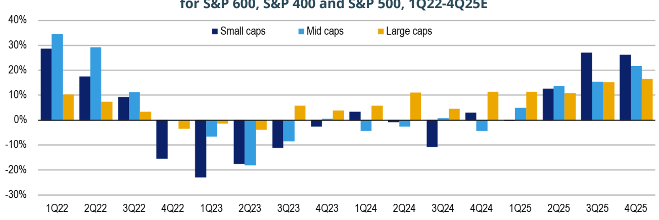
Exhibit 3: Bottom-up Consensus Quarterly YoY ESP Growth for S&P 600, S&P 400 and S&P 500, 1Q22-4Q25E

Key to this valuation set up is the consensus forecast for small cap earnings to continue to recover and accelerate from 2024 throughout 2025. Exhibit 3 below shows consensus earnings for small caps (the darker blue bars) are expected to continue to recover and accelerate on a year-over-year basis: