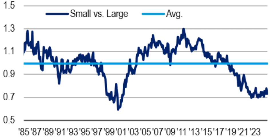
Exhibit 1: Small Caps Remain Historically Cheap vs Large Caps Relative Forward P/E: Russell 2000 vs Russel 1000, 1985-12/31/2024 .5