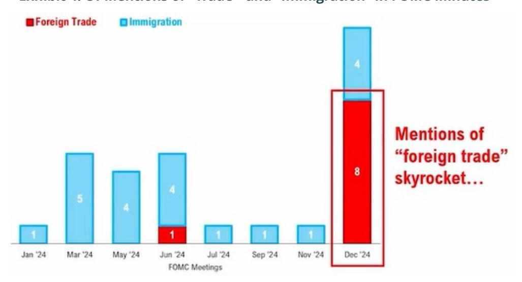
Exhibit 4: Of Mentions of "Trade" and "Immigration" in FOMC Minutes

Another concern for the market is the likely reduced immigration and potential deportations. While deportations are likely to be very limited (despite the rhetoric, Trump's first term saw far fewer deportations than other presidential terms since at least 1980), they are causing concern around labor availability in the housing, construction, hospitality and other industries with higher levels of migrant labor.